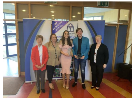
PLACE-EE participants and facilitators at the presentation of awards in Limerick, May 2019