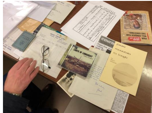
Historical artefacts in FODC

* For further information on LGNI: https://linkinggenerationsni.com/