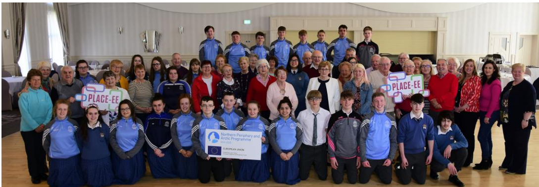
All participants and facilitators at the final intergenerational workshop in Limerick