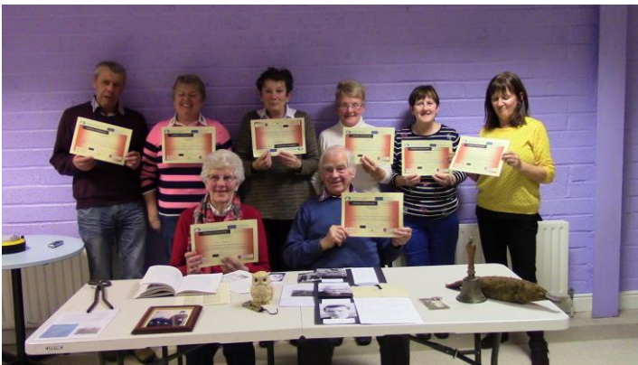
PLACE-EE participants with their certificates of achievement in FODC

All photographs from awards events and intergenerational workshops can be viewed on the website under 'Outreach Groups' (website information on page 5).