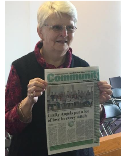
A PLACE-EE participant sharing a cultural artefact in Limerick

The success of the first workshops in Limerick has continued, with an average of 21 younger and 23 older participants attending sixteen workshops. Topics of conversation focused on local heritage, knowledge, and culture, resulting in many stories, photographs, and memories being shared between generations. Participants also discussed how artefacts could be digitally captured for the online archive and they continue to work together to implement this. To complement the PLACE-EE workshops, LCCC ran a series of IT training sessions for older people, which have been very successful.