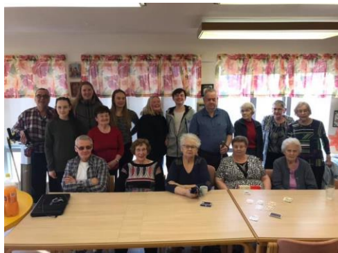
PLACE-EE participants in Fjarðabyggð

Elder participants explored how IT can help them in their everyday lives and they brought coffee, homemade baked goods, and a wealth of artefacts and personal stories to share with the younger attendees.