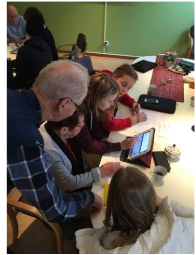
An intergenerational workshop in Skellefteå

Skellefteå Kommun have run a total of eleven workshops so far, attracting 25 younger participants and 10 elders (an average of 8 elders attended the workshops). Participants continued to engage with Virtual Reality during their meetings and students assisted elders with technology in a designated 'tech corner'. They also discussed online safety and local culture and history, often focusing on the regional dialect 'bondska'. A wrap-up celebration was enjoyed by all during the final joint workshop.