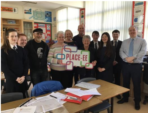
PLACE-EE participants in Dromore, County Tyrone

FODC CEO Leza is currently consulting with local older person clusters to understand what courses they would like in the future and is meeting other local groups to deliver IT training and reduce social isolation. For the next stage of PLACE-EE, FODC also plan to work with primary schools in two other areas of the district.