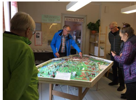
Elders visit Hembygdsområdet to research local history

Umeå University have completed development of the PLACE-EE Transnational Cultural Archive and the platform is now ready for content to be uploaded from each of the demonstrator areas. The archive will be ready to view online in early 2020 and details of how to access it will be included in the next issue of our newsletter.