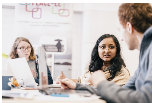
Second place team.

The mobile phone app identifies emotions in real-time to provide a personalised recommendation system that can assist the elderly within their comfort zones. The lives of elderly people pose a great deal of challenges. Ranging from their day-to-day activities such as mobility, medications and self-care to their physiological well-being such as social connection and sense of purpose, the constant need to adapt to a fast-moving world with technology driving the forefront pose a challenge to the elderly.