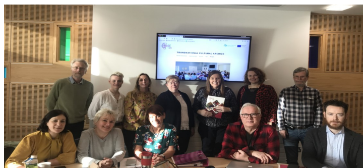
Participants at Partner Meeting January 2020, Ulster University

Project Closure event Friday—3 April 2020, Belfast. Details are being arranged and will be available shortly. Final Project Partner Meeting - 2 April 2020.